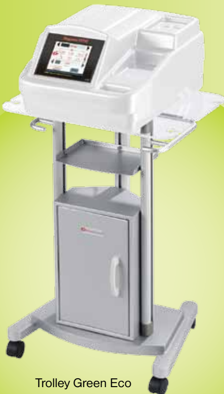
Trolley Green Eco